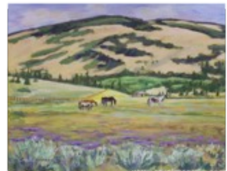
"Mountain Pastures" Oil 11" x 14"

"A Painting is a Feeling Seen" Carol McArdle