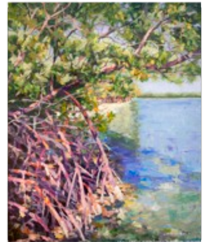
"Tropical Coastline" Oil 30" x 24"