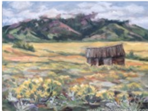
"Weathered Beauty" Oil 16" x 12"

Check out the 9 new paintings on my Western Paintings webpage.